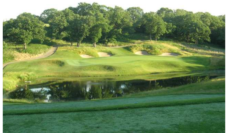
Beautiful Quarry Oaks Golf Course